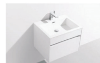
Vanity & basin