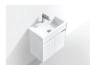
Vanity & basin